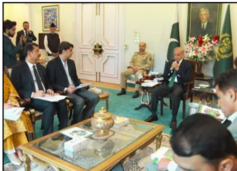
The meeting of the National Polio Management Team was held on August 7 - 8, 2024.