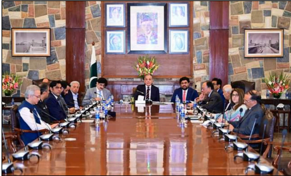
The Honourable Prime Minister chaired a review meeting on Polio on July 31, 2024.

Polio eradication. In pursuance of the same, the first stock take was chaired by the Honourable Prime Minister on August 9, 2024 , with the objective to review the revitalized efforts under the 2-4-6 roadmap prepared by the country programme.